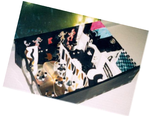
Able and Talented