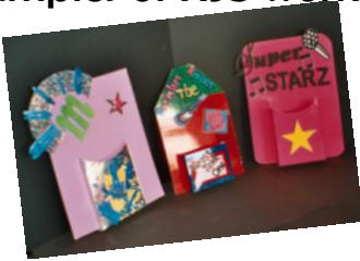
Year 8 graphics