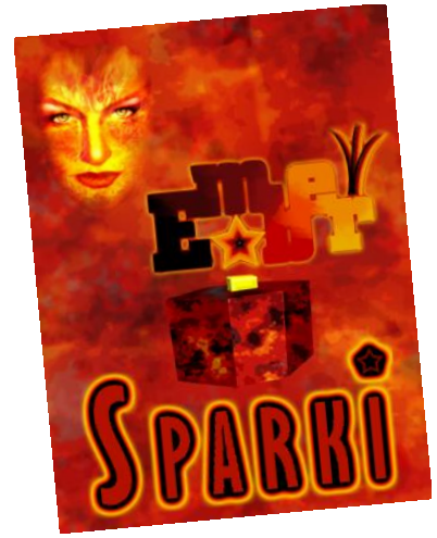
Textiles & Graphic Products