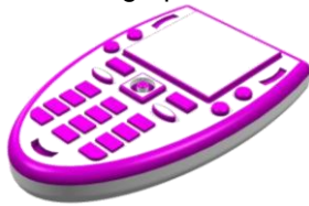
GCSE Product Design Year 9